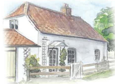
Yew Tree Cottage is over 200 years old and was built in the local 'mud and stud' style with a thatched roof

At the road turn left along Hemingby Lane 4, following the Viking Way. The Viking Way is 147 mile long distance footpath running from the Humber to Oakham in Rutland.